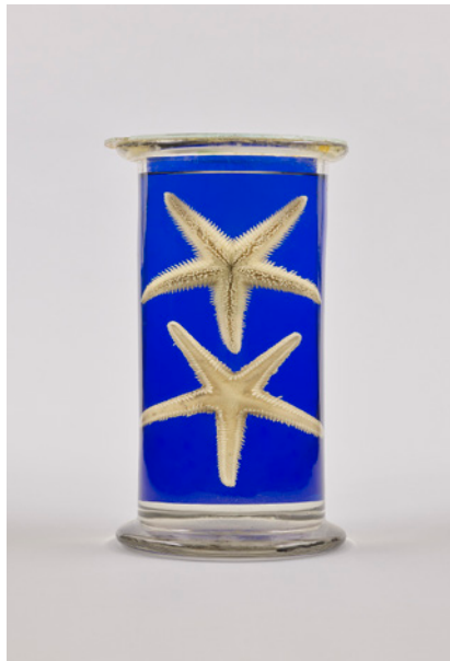
Red comb star Naturéum–Muséum cantonal des sciences naturelles, Lausanne