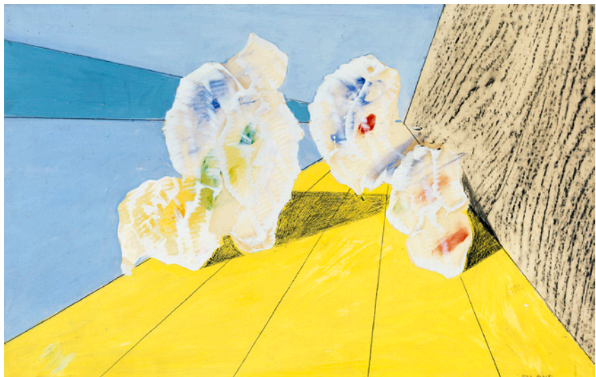
Max Ernst (1891–1976) Coquillage jaune [Yellow Shellfish], 1928 Oil, graphite, pencil and rubbing on paper mounted on canvas, 41 × 65 cm Private collection © 2024, ProLitteris, Zurich