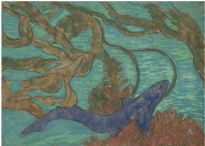
Jean-François Auburtin (1866–1930) Algues au requin bleu [Seaweed with Blue Shark], 1897 Gouache on paper, 73 × 100 cm Private collection, Paris