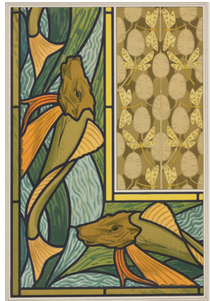
Maurice Pillard-Verneuil (1869–1942) L'Animal dans la décoration [Animal Decorative Elements], Paris, Librairie centrale des Beaux-Arts, E. Lévy Éditeur, 1897 Plate 27: Red mullets, stained-glass. Dragonflies and annual honesty ( Lunaria annua ) Collection de Marval