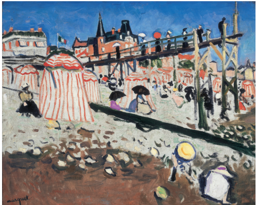
Albert Marquet (1875 - 1947) La plage de Sainte-Adresse [Sainte-Adresse Beach], 1906 Huile sur toile, 64,5 × 80 cm Private collection