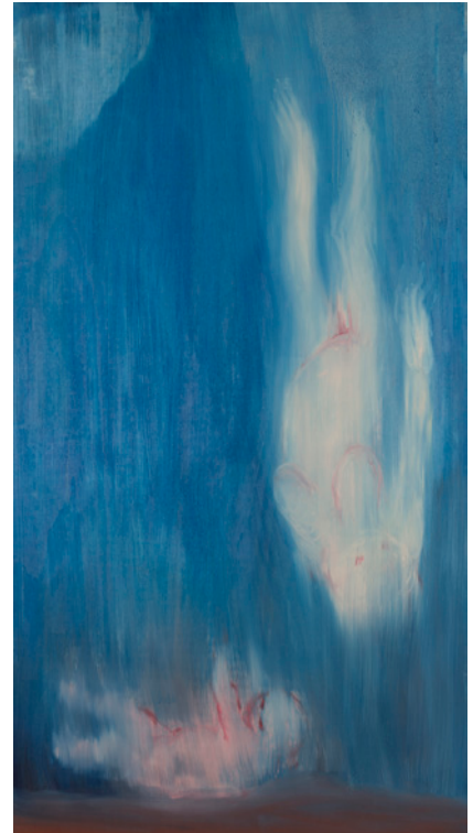
Miriam Cahn (*1949) unser meeresboden [our sea floor], 27.6.2021 Oil on wood, 220 x 120 cm Collection particulière