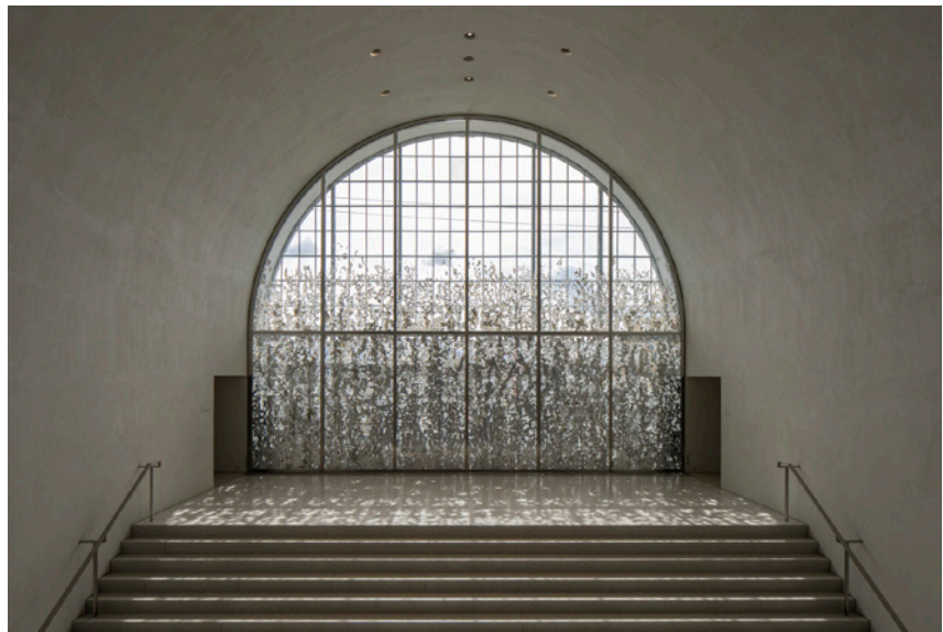
Sandrine Pelletier (*Lausanne, 1976) The Drowned World , 2024 Heated and burned mirror adhesive, 800 x 1000 cm Temporary installation The main hall's large glass window of the Musée cantonal des Beaux-Arts de Lausanne © Sandrine Pelletier