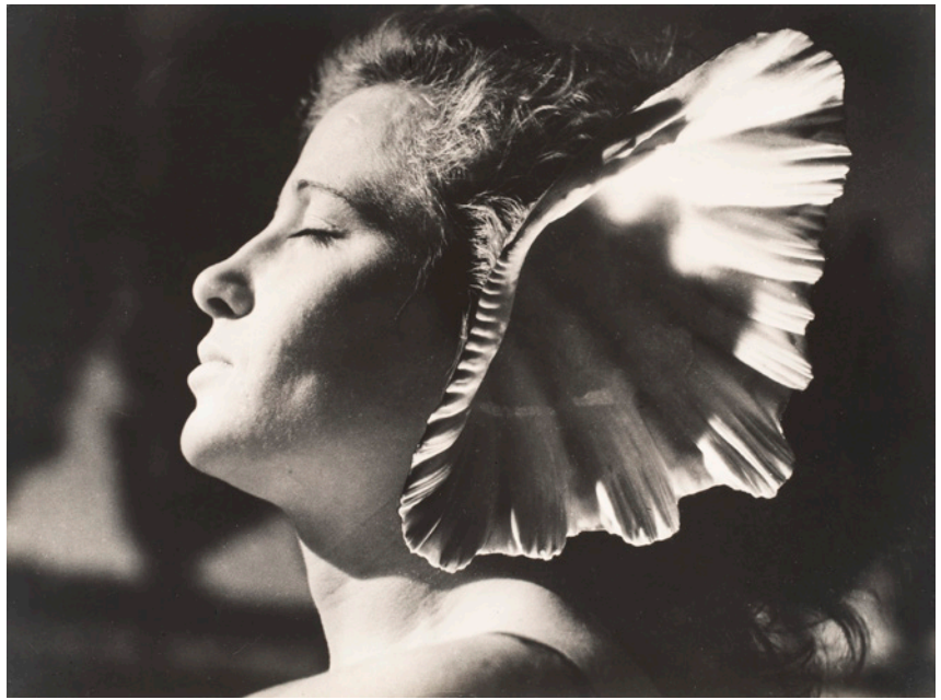
Pierre Boucher (1908–2000) Jeanine à la conque [Jeanine with Conch Shell], 1938 Photomontage, gelatin silver print, 29,5 × 39 cm. Reprint (1965) Fonds photographique Bouqueret-Rémy, Paris © Fonds Pierre Boucher Photo: Jean-Louis Losi, Paris