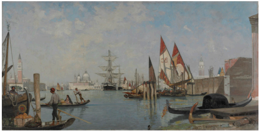
François Boccion (1828–1890) Venise [Venice] , 1882 Oil on canvas, 76,5 × 149 cm Lausanne, Musée cantonal des Beaux-Arts de Lausanne