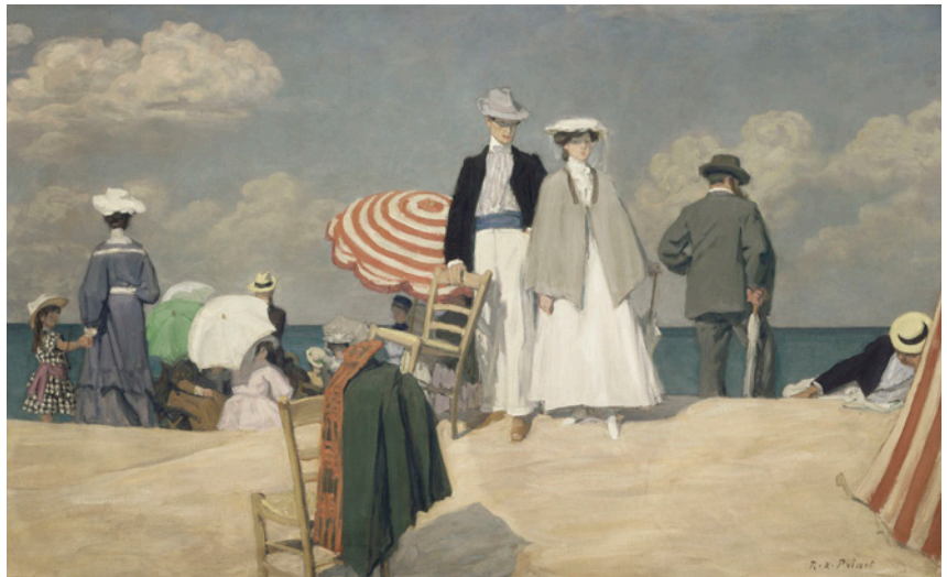
René-Xavier Prinet (1861–1946) La Plage de Cabourg [Cabourg Beach] , 1910 Oil on canvas, 94 × 150,5 cm Paris, Musée d'Orsay. Don de la famille Lebée, in memory of Jeanne Prinet, through the Société des amis du musée d'Orsay, 1991