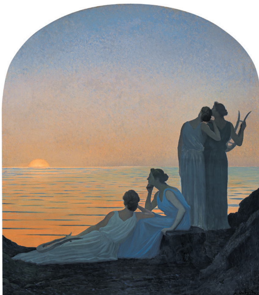
Alphonse Osbert (1857–1939) Soir antique [An Evening in Ancient Times], 1908 Oil on canvas, 150,5 × 135,5 cm Paris, Petit Palais, Musée des Beaux-Arts de la Ville de Paris

After publication, we would be grateful if you could send a copy of the publication to the press service of the Musée cantonal des Beaux-Arts de Lausanne.