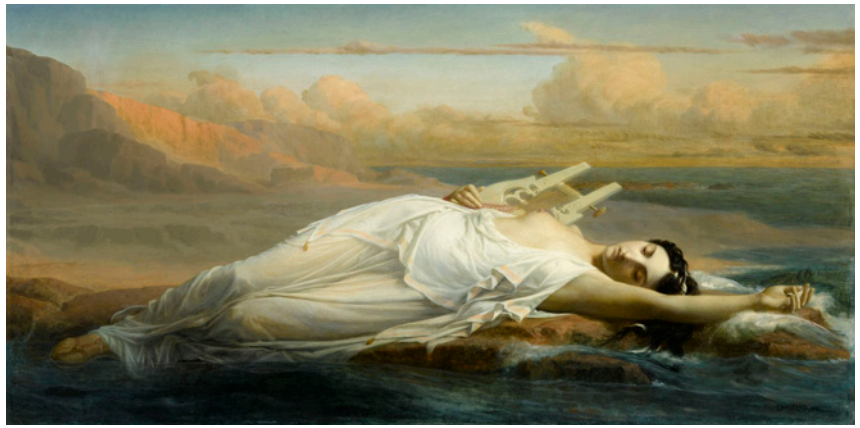
Joseph Thomas Chautard (1821–1887) Sappho , 1850 Oil on canvas, 92 × 192 cm Ajaccio, Palais Fesch-musée des Beaux-Arts