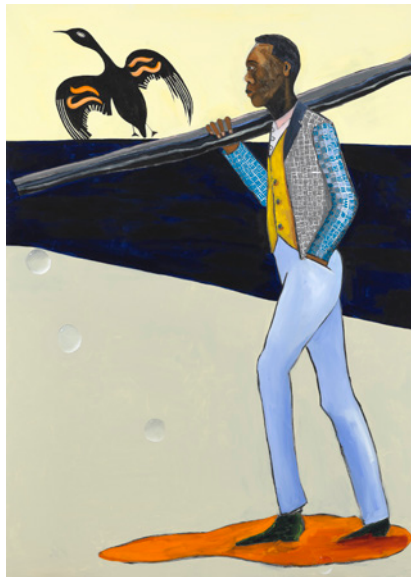
Lubaina Himid (*1954) Accidental Encounter , 2021 Acrylic on canvas, 213 × 152 cm Lausanne, Musée cantonal des Beaux-Arts © Lubaina Himid